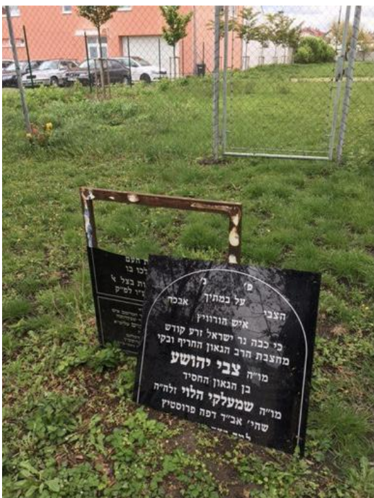
Desecration of the memorial in April 2017