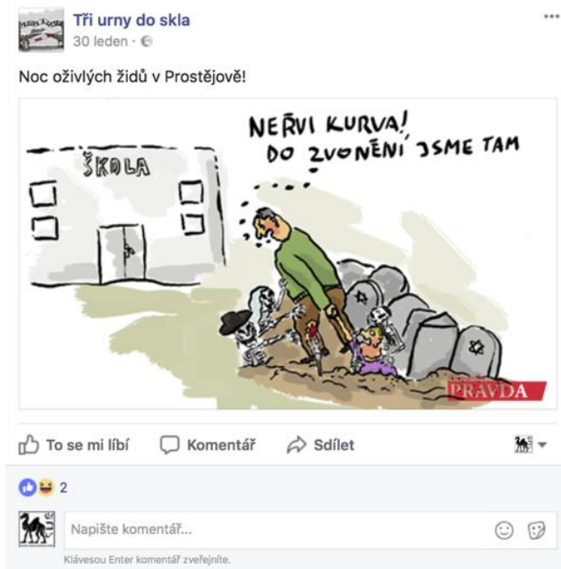
Cartoon published by the local electronic newspaper Prostějovská pravda in response to the Prostějov cemetery case. The cartoon, depicts Jewish zombies rising from their graves, trying to harm a child, who is trying to get to his school. The cartoon is titled: “The night of living Jews in Prostějov!”. “Shut the f—k up! We’ll get there before the class starts!” ( Prostějovská pravda , January 2016).

There could be legitimate discussion, whether the Kolel Damesek Eliezer foundation could have approached and handled the issue more sensitively. However, not even a significant PR mistake would have justified some of the hostile responses, we have observed. Despite the generally low levels of antisemitism in the country, one has to be careful about local cultural context as there are local niches of communities where antisemitic beliefs persist.