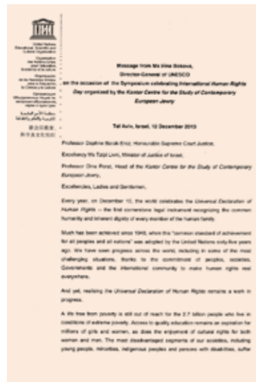
Message from Mme. Bokova