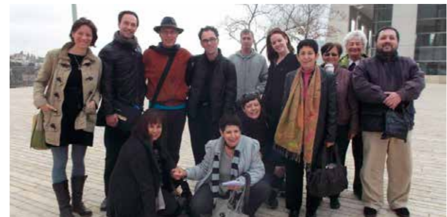
Visit of the staff and PHD students from Germany to Yad Vashem

The PhD fellows and doctoral students provided the Center's staff with lectures presenting their research projects, followed by a lively discussion among the participants.