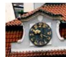
Photo of the Old Jewish Town Hall clocks in Prague. The clock with Hebrew letters signifies the Jewish time, while the clock above it has Roman numerals and signifies the general time – of which the Jewish time is a part.