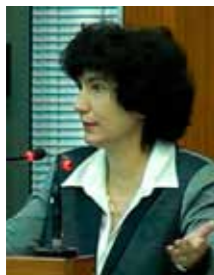
Prof. Daphne Barak-Erez, Supreme Court Justice