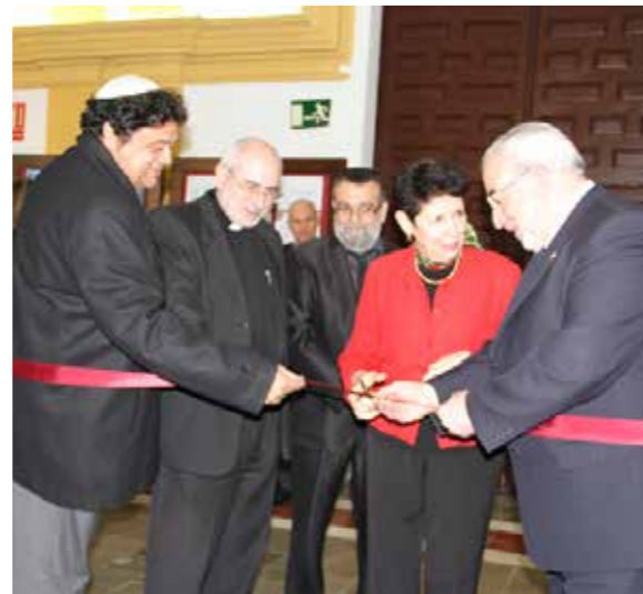
Inaugurating the Anne Frank Exhibition