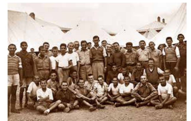
A picture from the invitation to the 70 th Anniversary of the Tehran Children conference